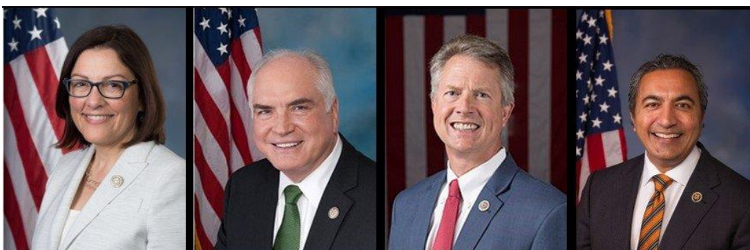
116TH CONGRESS 1ST SESSION